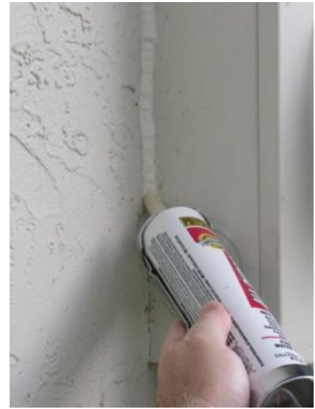
Sealing around an electrical disconnect box