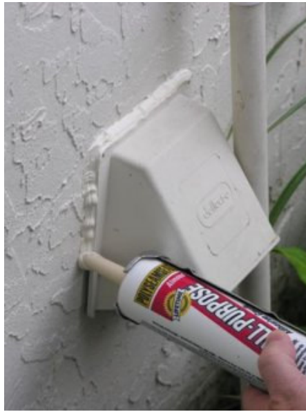
Sealing around a dryer duct hood