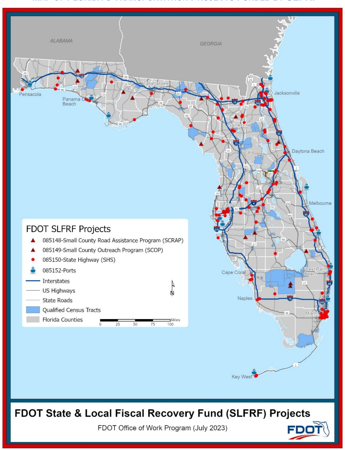
MAP OF FLORIDA'S TRANSPORTATION PROJECTS FUNDED BY SLFRF

repair or rehabilitation of county bridges, for pavement of unpaved roads, for addressing road-related drainage improvements, for resurfacing or reconstructing county roads, or for constructing capacity or safety improvements to county roads. SCRAP is for resurfacing and reconstructing county roads.