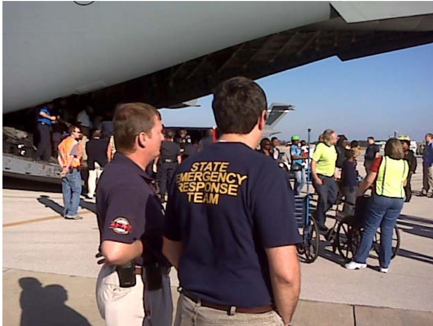
Personnel ready to assist repatriates as they disembark their flight from Haiti at Sanford International Airport

provided assistance with overnight lodging and cash assistance as well as transportation to their final destination through the Repatriation Loan Program.