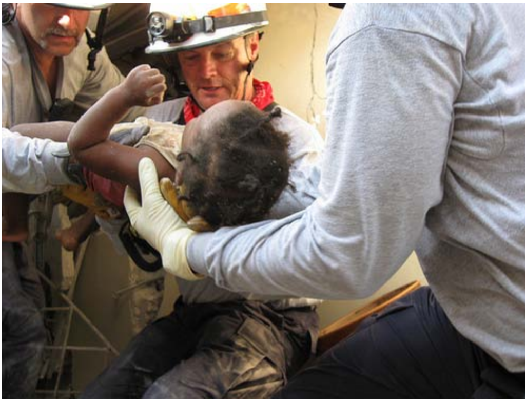
Miami-Dade Task Force 1 rescues a trapped Two-year old.

Due to the close proximity to Haiti, Florida-Task Force 1 (82 personnel) & Florida-Task Force 2 (84 personnel) Search and Rescue teams were deployed to Haiti from January 14, 2010 to January 25, 2010. These two teams saved a total of 18 earthquake survivors, including a Pembroke Pines woman who spent five days trapped in debris. The Task Forces were assigned as a U.S. Agency for International Development (USAID) asset through an interagency agreement executed between the Federal Emergency Management Agency (FEMA) and USAID.