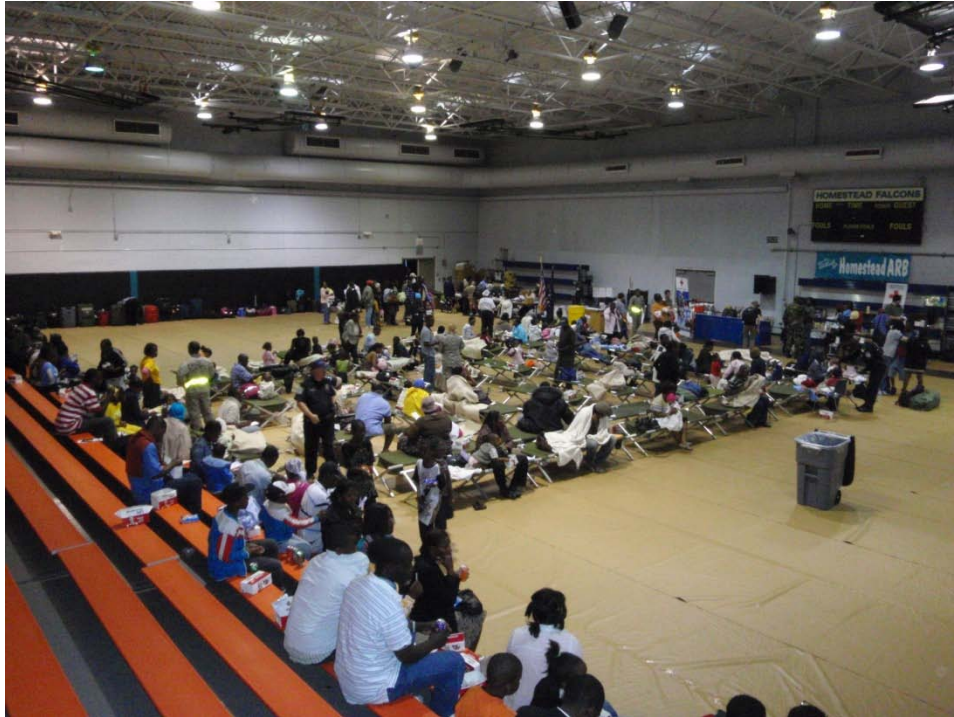
Repatriates fill the processing center located at the gymnasium at Homestead ARB.

Translators were also on hand at HARB, the reunification center at St. Thomas University, and Miami International Airport. Early in the response effort Miami-Dade County surveyed their county workers and came up with a list of approx 8,000 people who spoke Creole. Miami-Dade Emergency Management (EM) helped to coordinate with Switch Board Miami for a 24-hour translator and mental health counselor for all locations. Additionally, HARB had several soldiers who spoke Creole and volunteered to help.