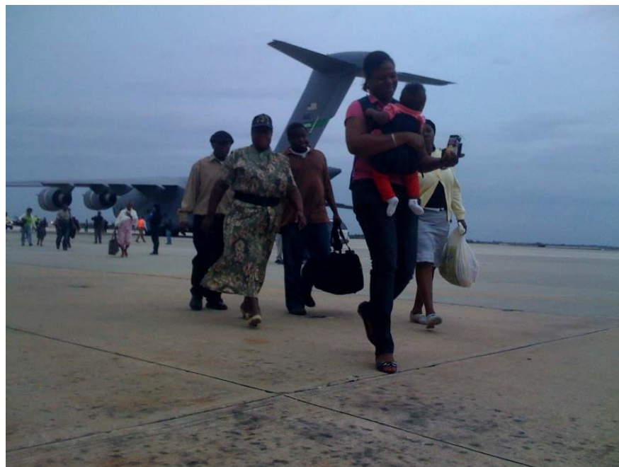
Repatriates on the tarmac Sanford International Airport after arriving from Haiti.

The deactivation of the State of Florida Emergency Repatriation Plan was authorized by HHS ORR on February 20, 2010.