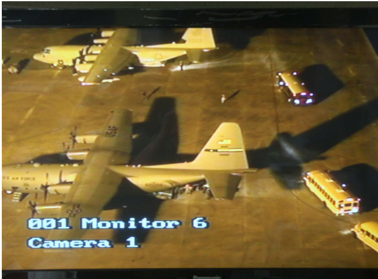
Flights arriving with awaiting buses to transport repatriates to the processing center at Homestead Air Reserve Base.

10. Ensure all federal emergency response agencies utilize the National Incident Management System.